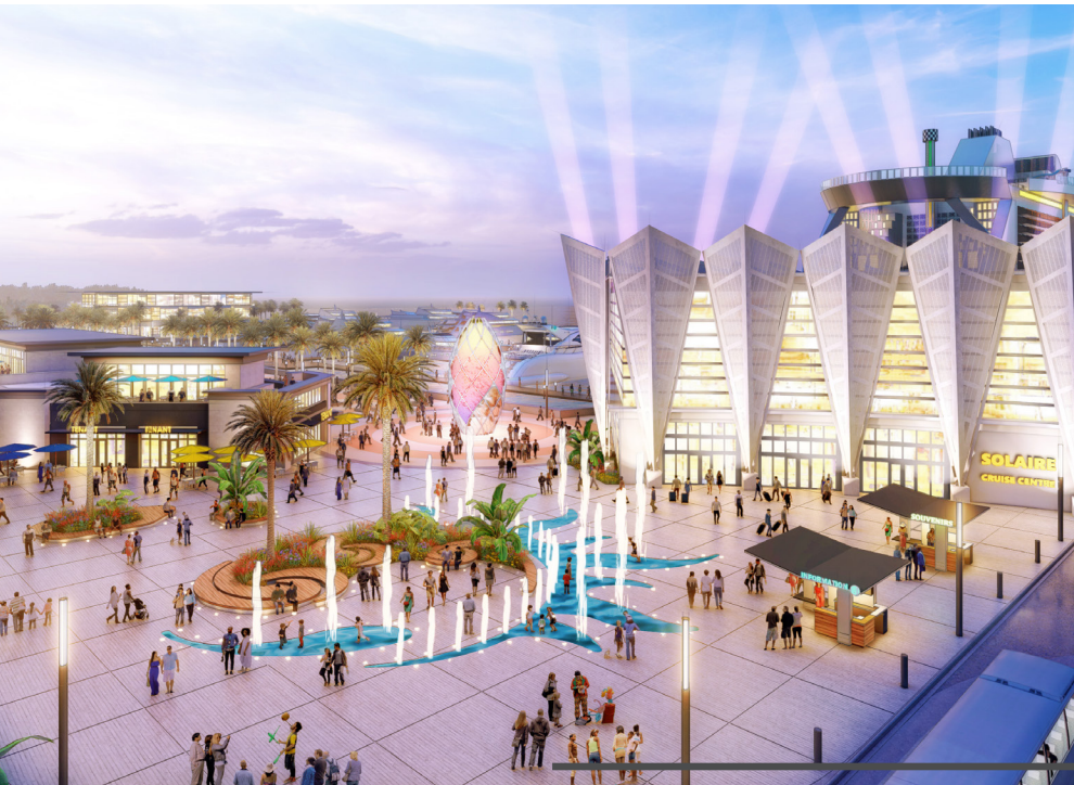
ARRIVAL PLAZA AND TERMINAL